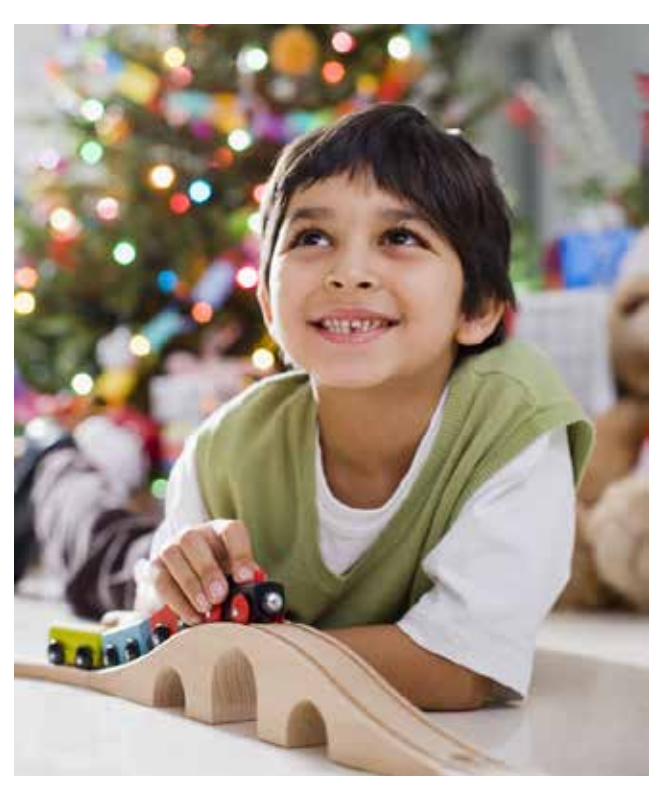
Shortly thereafter, the U.S. CPSC officially issued a second recall

Similar problems arose with certain Samsung Galaxy Note 7 phones in late 2016. The phone was recalled officially in the United States through Samsung, and the company launched exchange programs in other countries. Even replacement models continued to have problems, as some caught on fire in early October. Samsung ultimately told Note 7 owners to stop using the phones and return them before permanently discontinuing the product.