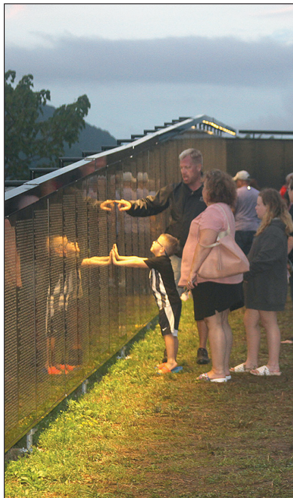
The touring replica of the Vietnam Veterans Memorial was in Newburgh in 2018.

“Nothing is more important to VVMF than the health and well-being of our