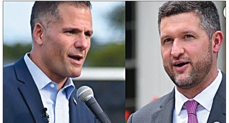
Republican Marc Molinaro (l.) and Democrat Pat Ryan (r) are running in a special election on Tuesday, August 23rd to represent the NY 19th district in the U.S. House of Representatives.

Ryan said we need to invest in our roads and bridges, expand rail, help workers with training and technology so they can compete for good jobs, revitalize small businesses by reducing regulatory burdens while improving access to capital; ensure that equal work means equal pay regardless of gender; and move forward to expand equal rights for LGBTQ communities, especially in healthcare, housing, employment and