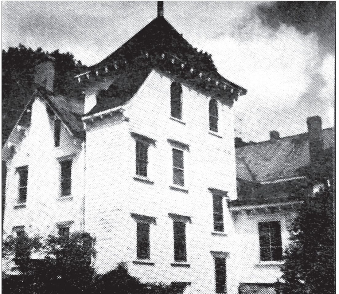
The farmhouse of the Beaver Dam Stock Farm, demolished in the early 1990s to clear the way for a parking lot for what was then the Baxter Health Care Distribution Center.