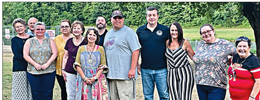
Walden Community Council members enjoy their annual picnic at James Olley Park.

The Walden Humane Society, 2489 Albany Post Road, Walden, will hold their next indoor yard sale on Thursday, August 18, 9 a.m. - 3 p.m. All purchases benefit the care of the animals at the shelter. Please also bring a donation of food, litter, old towels or cleaning supplies.