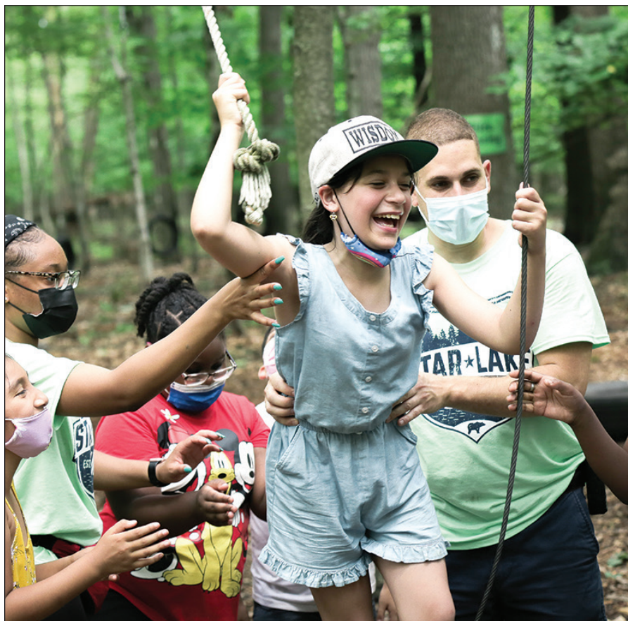
Several campers and counselors enjoy a fun time at a ropes/obstacle course.

On the morning of the trip's departure, nine new campers, with packed suitcases and smiles on their faces, shuffled into the Salvation Army Newburgh travel van, ready to head off for a week of fun and adventure at Star Lake Camp. Several parents of this year's campers had attended Star Lake Camp as children and were excited to send their children to camp and hoped they would have a good experience like they did.