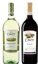
CAVIT ALL VARIETIES 1.5L $12.99 REG. $15.99