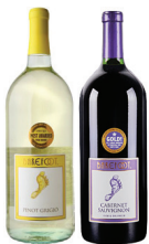
BAREFOOT ALL VARIETIES 1.5L $10.99 REG. $13.99