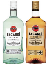
BACARDI SILVER OR GOLD 1.75L $19.99 REG. $22.99