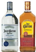
JOSE CUERVO SILVER OR GOLD 1.75L $34.99 REG. $40.99